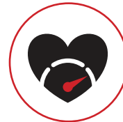
High Heart Rate