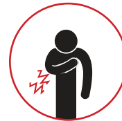
Nausea or Lack of Appetite