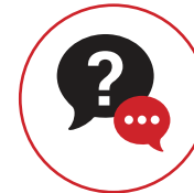
Confusion or Impaired Thinking