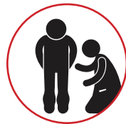
Build-up of Fluid (edema)