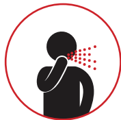
Chronic Coughing or Wheezing