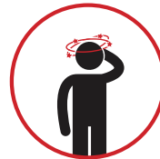
Fatigue or Feeling Lightheaded